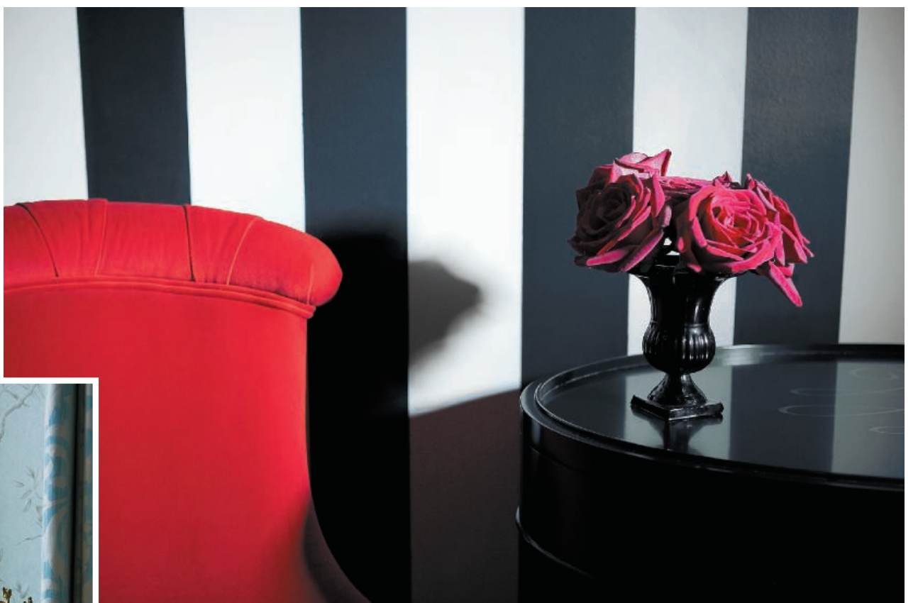
A red-hot rendition of the famous Draper Chair, designed by Draper in 1944 for the Fairmont Hotel in San Francisco. This moment greets guests stepping into the 11th-floor elevator lobby, which leads to the penthouse's massive front doors. The wide black-and-white stripes? Pure Draper.