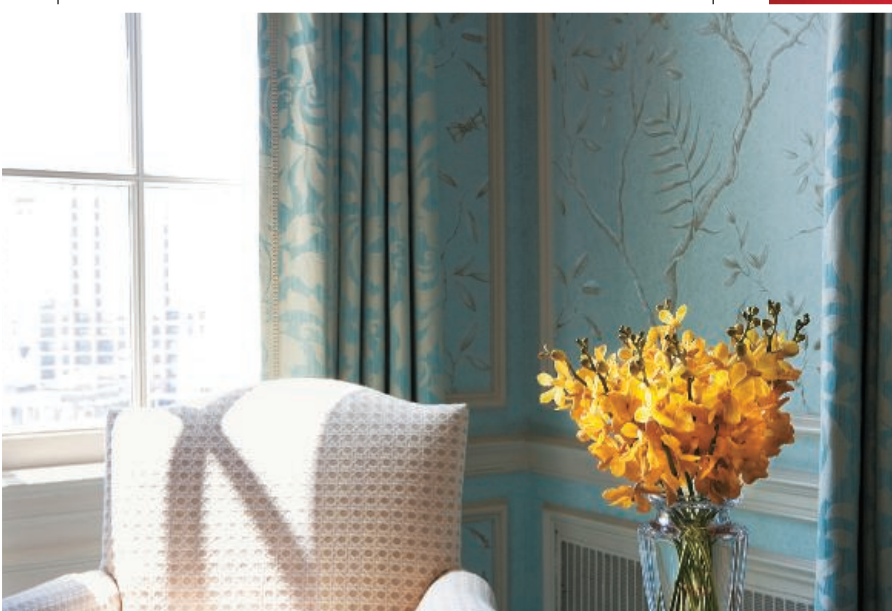
A sunny corner of the Presidential Suite's bedroom. The wallpaper is a Draper design, from Varney's line, Carleton V Ltd.

Which brings us back to Carleton Varney. That was his doing, as was the same red for the music room, the black-and-white geometric rug under the room's wildly floral sofa, wildly striped chairs, the softly tropical blues and greens of the oval dining room and — you get the drift. Varney loves color and pattern. Draper loved color and pattern. Varney makes no bones about it, as he zigzags about in his white slacks, pink blazer and sky-blue kerchief: The whole penthouse, he says, is "my homage to Dorothy." And he's not finished. More to come, he says, in the way of exuberant accent pieces, a fabulous Aubusson rug for the gallery hall, pops of blue-and-white porcelain, even contemporary paintings to replace the more traditional portraiture that hangs about. Stick around, he says, because the penthouse — already back in swing as a setting for weddings, receptions, meetings and glittery affairs, complete with two luxurious bedroom suites, a clubby library and an adjoining bridal suite — will become "more intimate, more homey, like someone lives here." Judging from this first look, we'd say that a certain spirit — initials D.D. — already does.